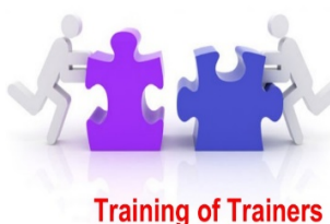
Training of Trainers

The purpose of the handbook is to equip adult educators and training professionals with practical knowledge and hands-on guidance on how to incorporate the new approach into their educational practices, especially in the field of teaching entrepreneurship, how to create learning resources and teaching materials, and how to involve their learners into self-learning activities based on chatbot learning environments.